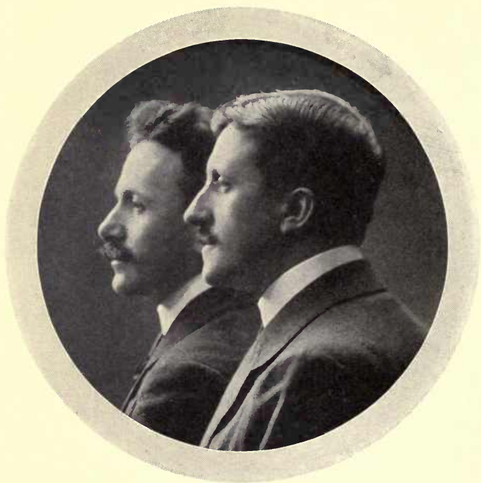
SERAFÍN AND JOAQUÍN ÁLVAREZ QUINTERO